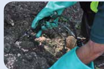
The state-of-the-art QUIK-jet AIR system that we use for injecting.