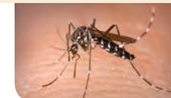
The Asian Tiger Mosquito (above) is large and spotted and active during the daytime in full sun -- while the native Northern House Mosquito (below) is much smaller and active in the shade and at dusk.

Call your branch office for more information or visit almstead.com/tick-mosquito-control .